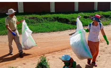
Living their faith, Mission Doctors become integral to the communities they serve. Together with you, they deliver hope and healing.